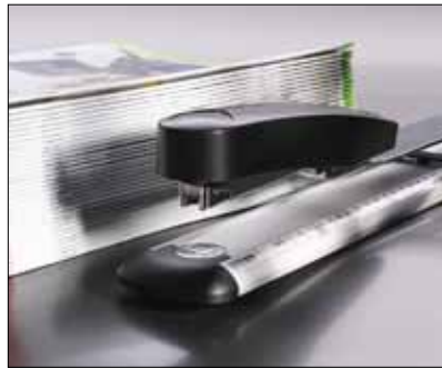
An 11 3/4" throat depth for greater reach across documents, is perfect for binding booklets.