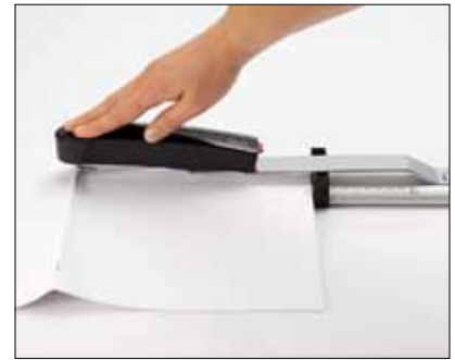
Adjustable depth guide ensures you staple at the desired depth each and every time