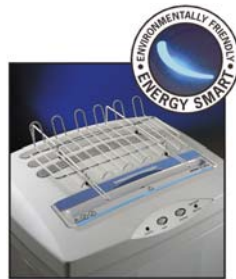
Adjustable computer forms top shelf (Space Saving Design). Integrated sliding flap makes Floppy-Disks and CDs shredding easy