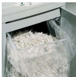
Front door for easy emptying of collecting bag