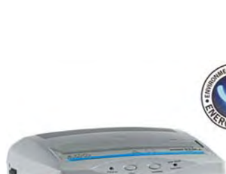
"ENERGY SMART" Management system for zero power consumption in Stand-by mode