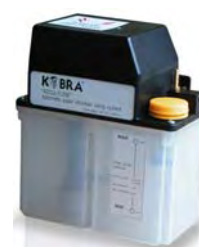
KOBRA "ACCU-FLOW" Automatic oiler Performs automatic lubrication of the cutting knives for maximum shredding capacity (option)