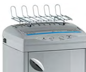
Computer forms top shelf to save office space (Space Saving Design)