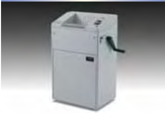
Manual crank, a standard feature on the 260 HS-2, to shred documents in case of power loss.