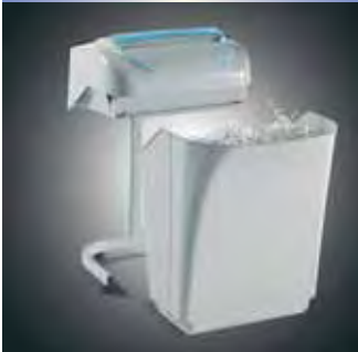
Removable 9.5 gallon waste bin for easy disposal of shredded materials.