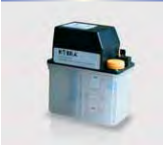
Available KOBRA Accu-Flow Automatic Oiling System eliminates the need for manual lubrication.