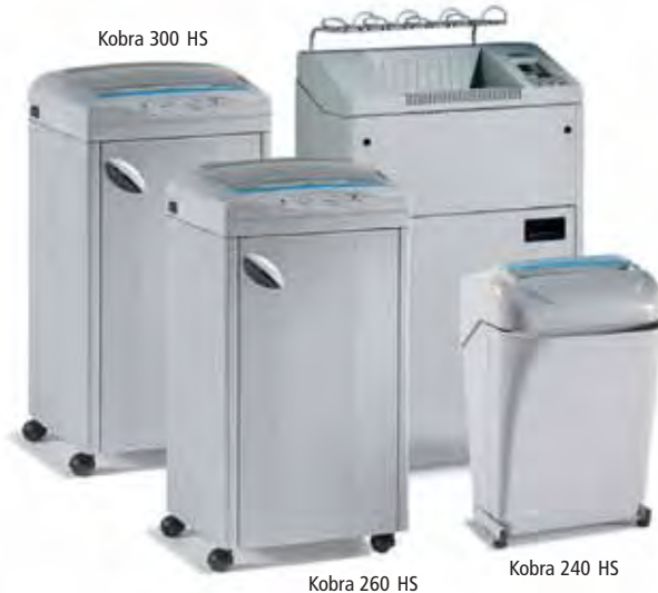
Kobra 300 HS