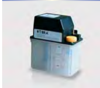
Available KOBRA Accu-Flow Automatic Oiling System eliminates the need for manual lubrication.