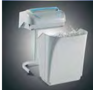
Removable 9.5 gallon waste bin for easy disposal of shredded materials.