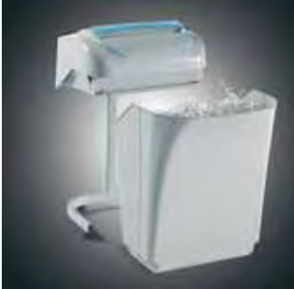
Removable 9.5 gallon waste bin for easy disposal of shredded materials.