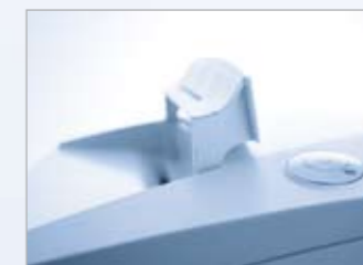
The safety cover can be simply folded up in order to shred large amounts of paper.