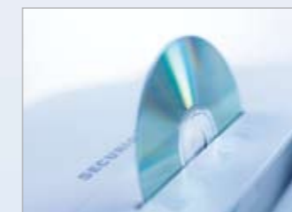
At security level 2, the SECURIO B24 can also shred CDs with ease.