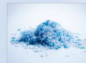
Security level 4 – Particles When the confidentiality of documents is important for a company's existence. Cutting size: 1.9 x 15 mm.