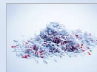
Security level 3 – Particles For confidential documents such as personal data. Cutting size: 4.5 x 30 mm.