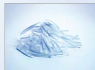
Security level 2 – Strips For internal documents that need to be rendered illegible such as computer lists or bad photocopies. Cutting size: 5.8 mm.