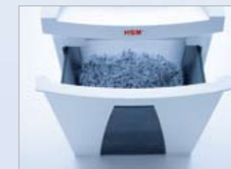
Tilting container for easy removal of the shredded material.