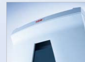
Container handle of elegant design.