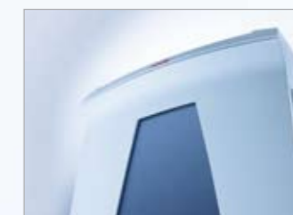
Due to its large collection volume, the SECURIO B34 is suited for use by several persons.