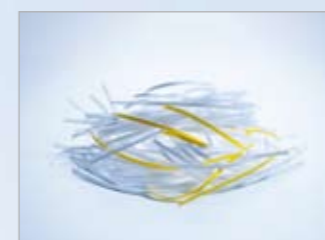
Security level 2 – Strips For internal documents that need to be rendered illegible such as computer lists or bad photocopies. Cutting size: 3.9 mm.