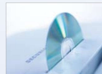
Special slot specifically for shredding electronic media.