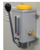
Optional EvenFlow™ reservoir and pump