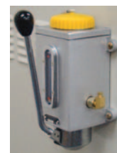
Optional EvenFlow™ reservoir and pump