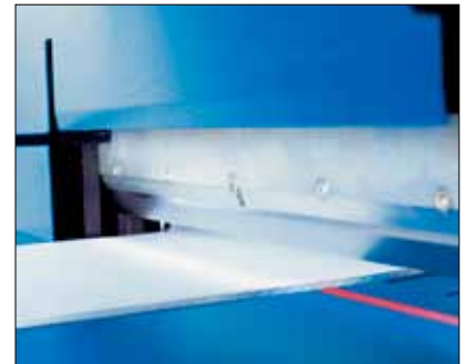
Ground Solingen steel blade cuts through up to 200 sheets of paper with ease.